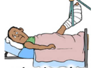
a broken leg