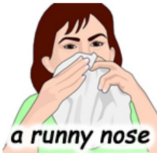
a runny nose