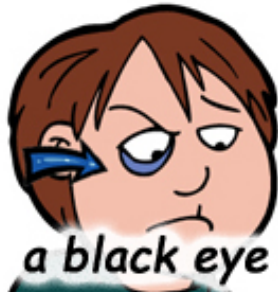
a black eye