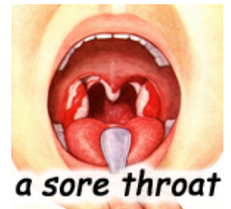
a sore throat